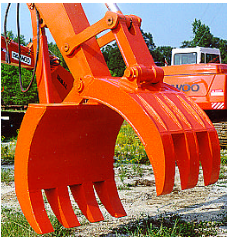
Fixed demo grapple with 3 x 4 tine. Also available with 2 x 3 tine and 4 x 5 tine

Contact us for further information and a quotation.