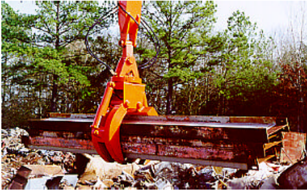
2 x 3 tine fully rotating scrap & demo grapple

We manufacture many different types and sizes of grapples. These range from a car grapple with an eight foot opening to a small railroad tie grapple. We can custom manufacture a grapple for you and your specific application.