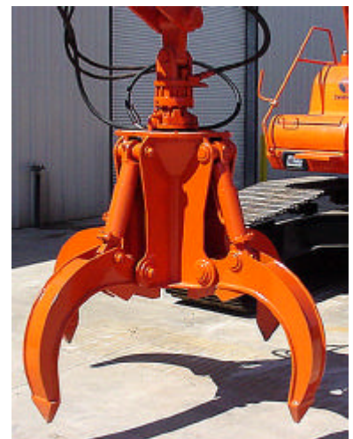
4 tine scrap grapple