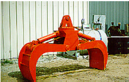
Heavy duty car grapple with 8' 6" opening

All grapples are furnished with or without the hanger that will fit your boom.